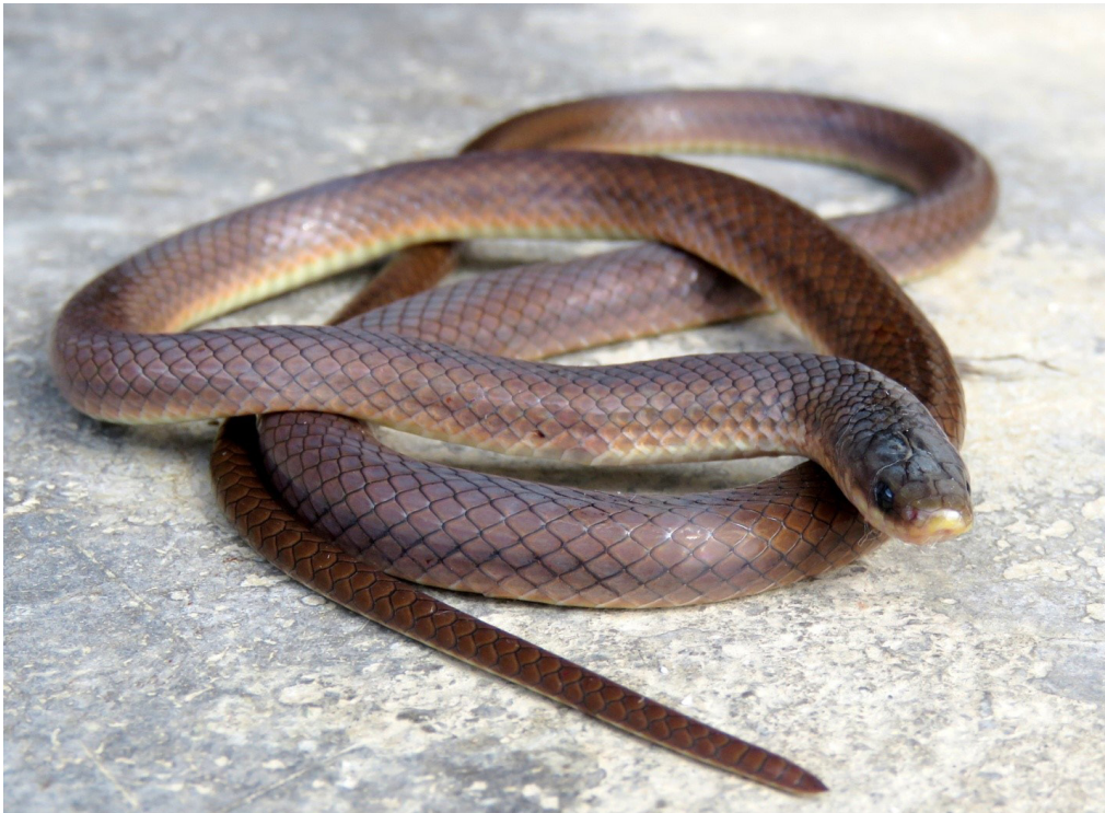
Fig. 1. Liopeltis rappi from Dhodeni, Kabilas, Chitwan.